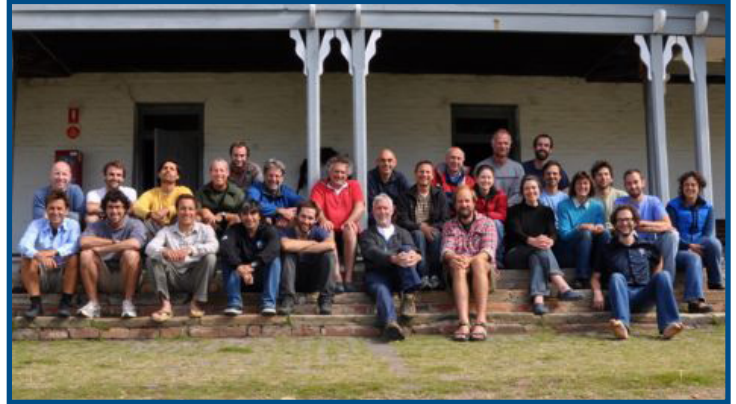
Research Team: The functional-diversity study was initiated during a November 2012 workshop in Tasmania.

Says Lefcheck, "Loss of species in a community in which all species are doing different things may have greater consequences, since each species plays a unique role that can't be filled by any other species. Investing resources in conserving the most non-redundant—and therefore vulnerable—communities may have the greatest impact."