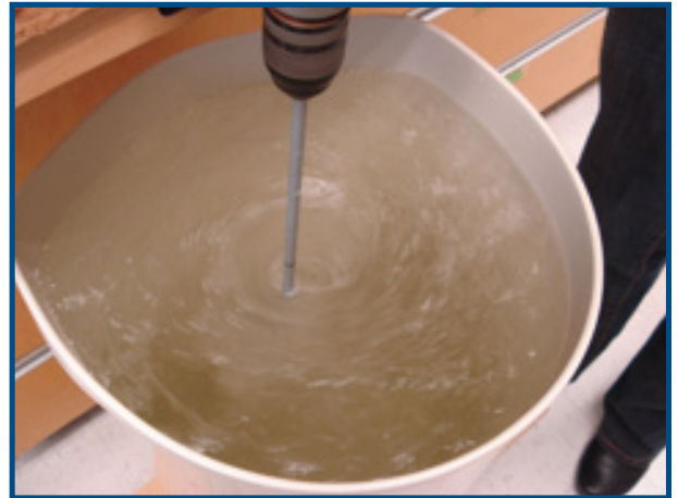
The researchers used a rotating paddle to create different levels of turbulence in the laboratory.

Their experiments also show that natural turbulence from tides, currents, and waves is unlikely to stress or kill copepods other than perhaps during an extreme storm event such as a hurricane or nor'easter.