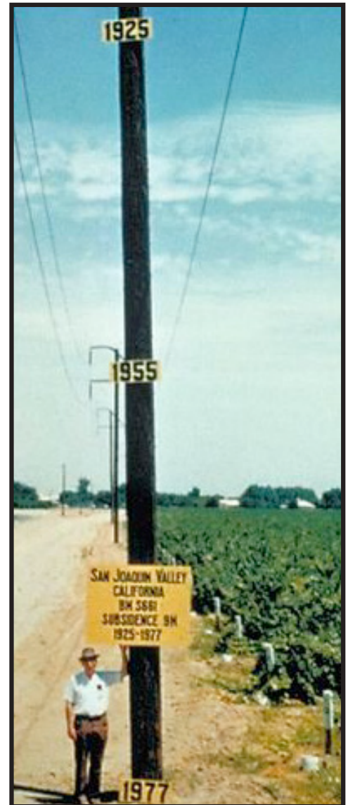
Signs show subsidence in land surface due to groundwater withdrawal in California's central Valley between 1925, 1955, and 1977.

"Reducing consumption—particularly in agriculture through development of drought-tolerant plants and more efficient irrigation methods—has its own costs," says Milliman. "But given that freshwater is a finite resource, using less seems the best solution."