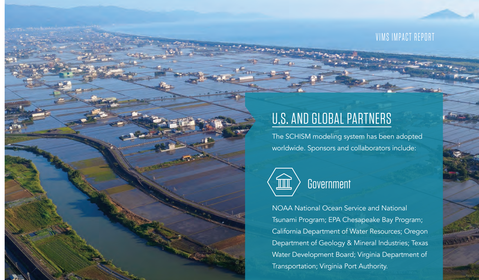
Taiwan is using the SCHISM modeling system to enhance forecasts for ocean flooding.